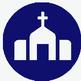
St. Ferdinand Church