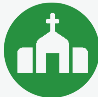
St. Ladislaus Church